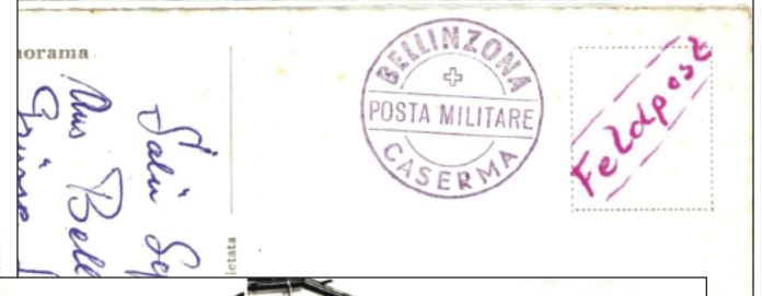
3161 Lugano. Monte S. Salvatore e lago